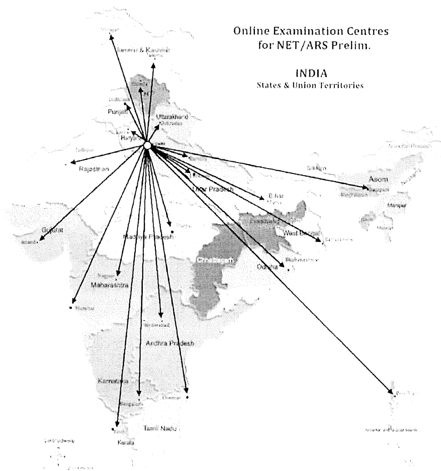
Distribution of examination centers across the country